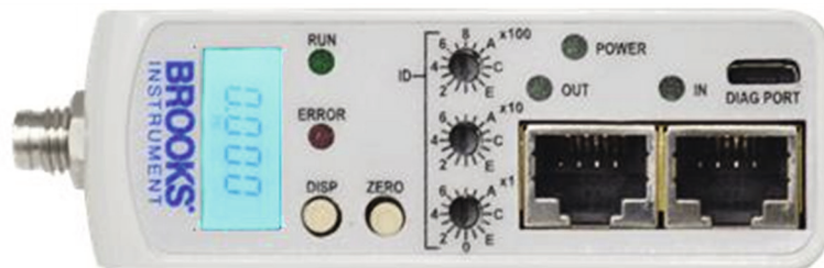
Figure 2-1 Top View of GF EtherCAT Device