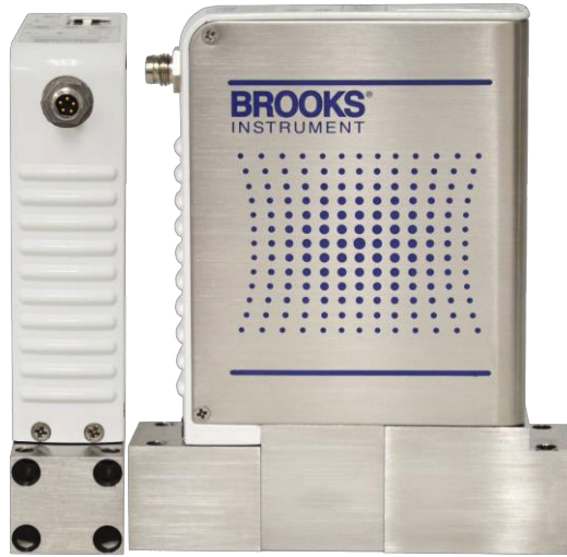
Figure 2-2 M8 Power Connector Location