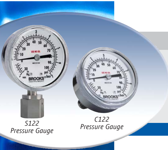
S122 Pressure Gauge