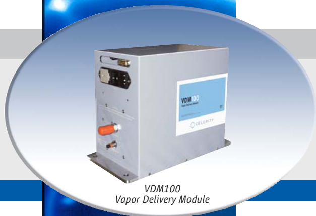
VDM100 Vapor Delivery Module