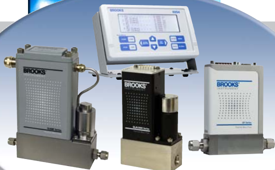
Smart DDE Supported Mass Flow Products